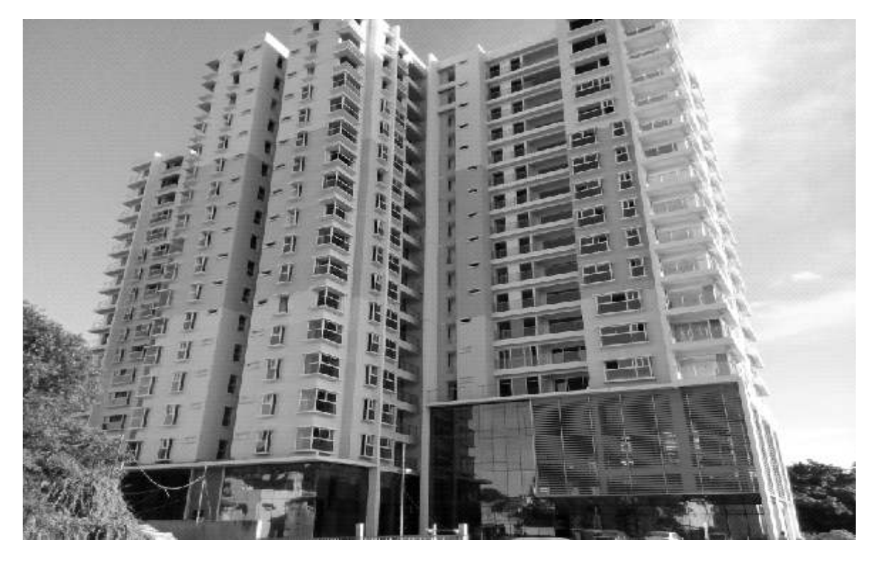
"TVH Quadrant - Multistoried" for True value Homes (I) Pvt Ltd, LB Road, Adyar, Chennai