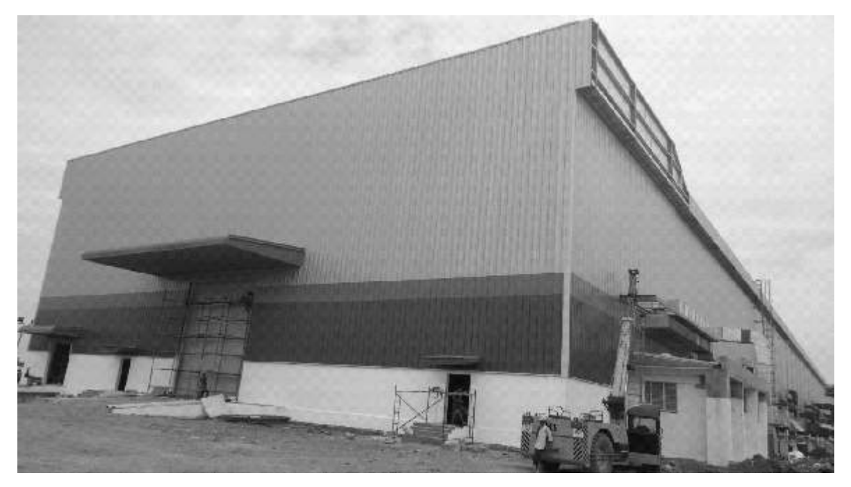
"Gamesa G122 Blade Plant" for Gamesa Renewable Private Limited, in SPSR Nellore