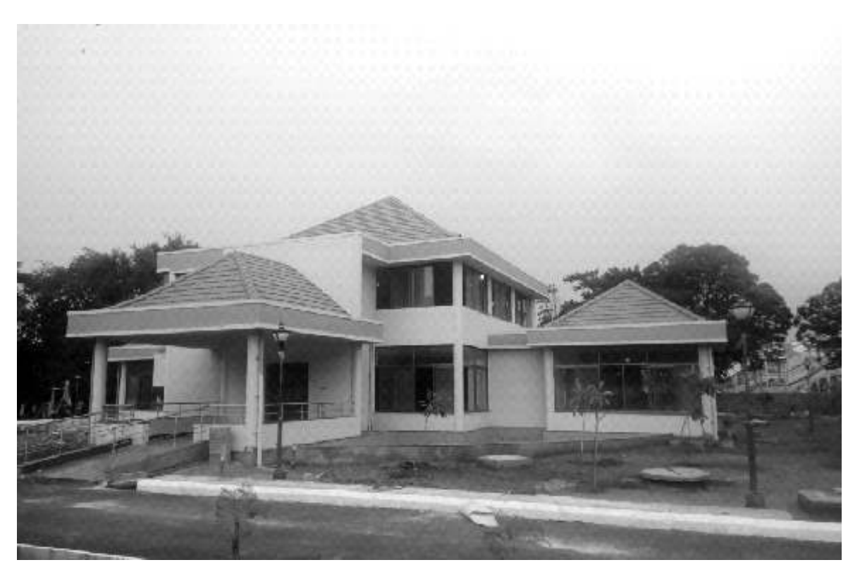
"Training Centre" for Bharat Electronics Ltd, BE Estate, Bangalore