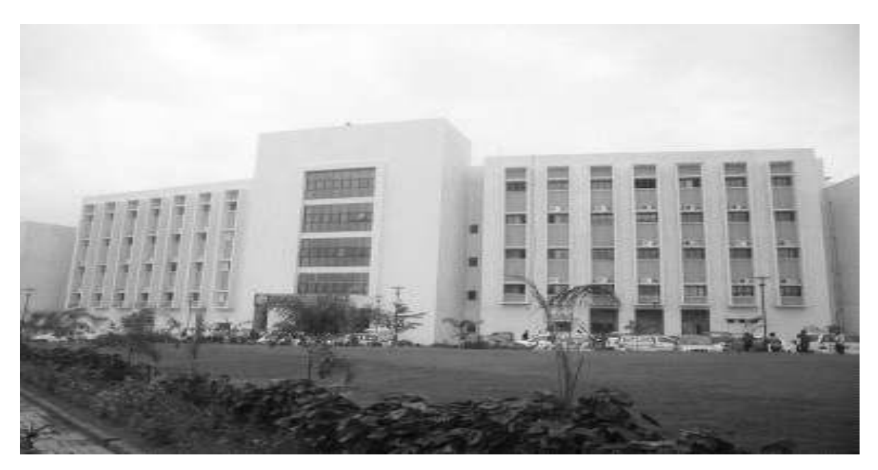
"Medical College Complex" for Ministry of Health & Family Welfare (AIIMS), Bhubaneswar